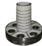
Multi Nozzle Assembly